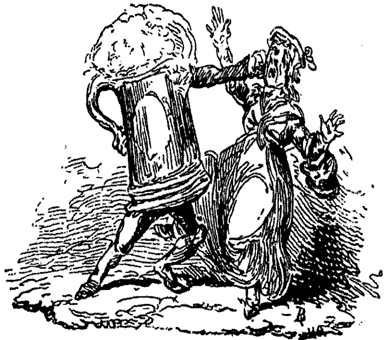
“Fighting the Pint Pot”

Adjourned at 7:30 with Responsibilities Statement.